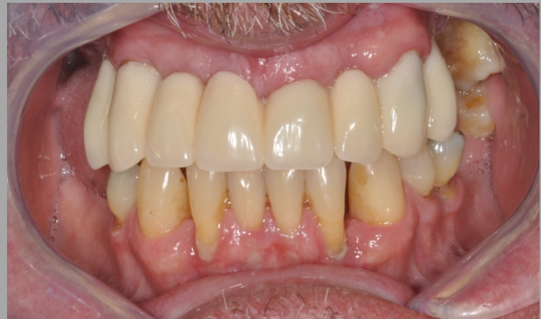
Temporary bridge on teeth used as transition, while implants are integrating