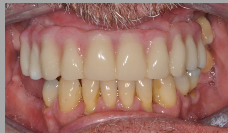
Final Hybrid (not removable)